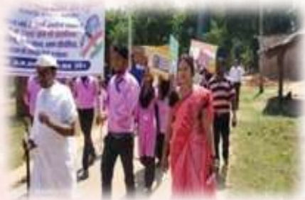
Celebration of Gandhi Jyanti