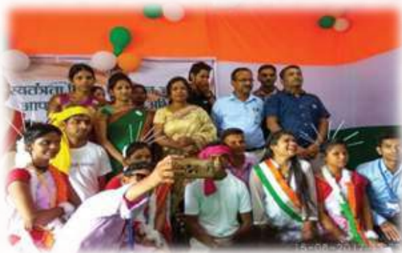
Independence Day Programme