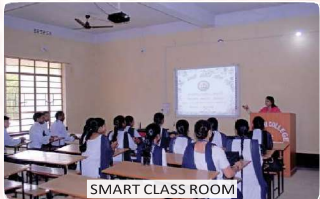
SMART CLASS ROOM