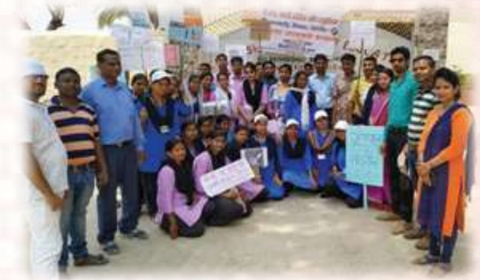
Matdata Jagrukta Abhiyan