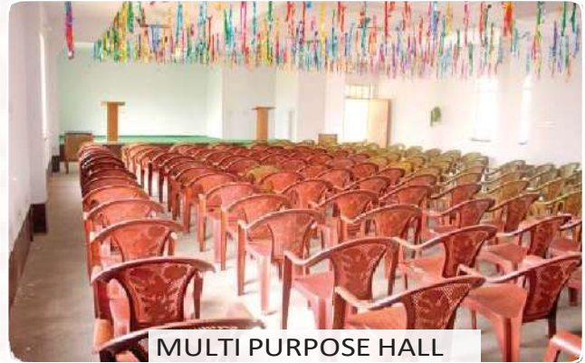
MULTI PURPOSE HALL