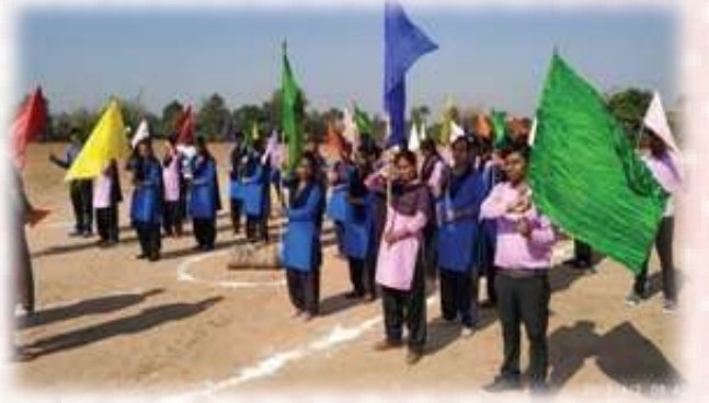
Annual Sports Day