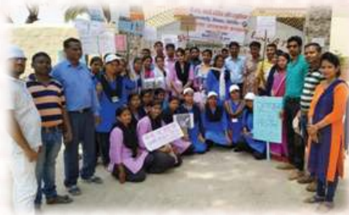
Matdata Jagrukta Abhiyan