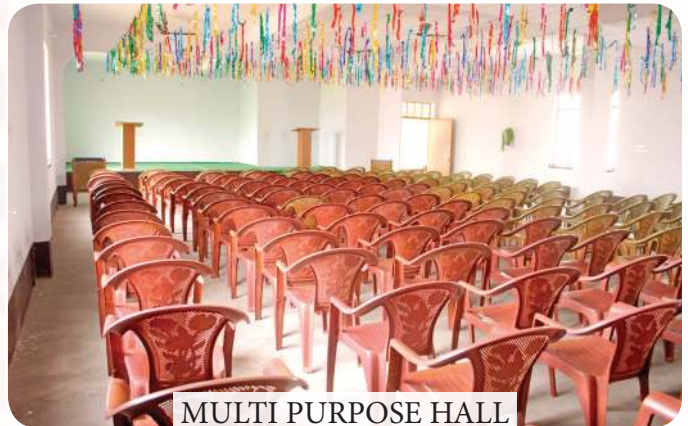
MULTI PURPOSE HALL