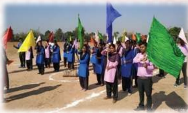
Annual Sports Day